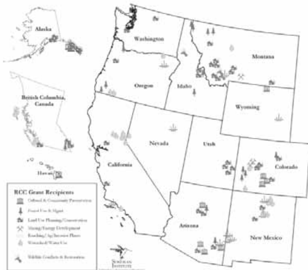
RCC project map 1998-2003.