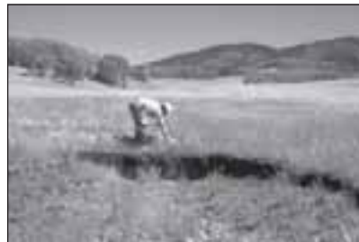
Installation of a log and fabric headcut structure on Holman creek meadow, September 2003