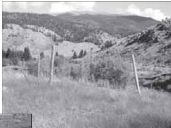
Top Right: Mini-elk exclosure installed in 1991 by New Mexico Game & Fish funded through a 319 EPA grant, September 2003.