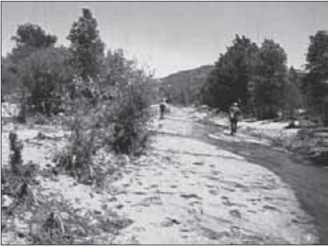
Date Creek before switching to dormant season grazing by cattle.