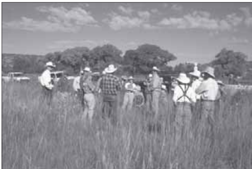
Quivira Coalition workshop participants on the U Bar Ranch near Silver City, NM, October 2003.

After I completed my book about ranchers and environmentalists working together— Beyond the Rangeland Conflict, Toward a West That Works —I was so impressed by the achievements of some of the ranchers I had written about that I continued to follow their efforts—visiting, photographing, monitoring. And I began to travel the West showing a collection of photos of the most incredible of their successes to anybody who would take the time to look.