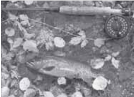
Rio Grande Cutthroat Trout.

Accepting his invitation for a tour, I quickly learned why.