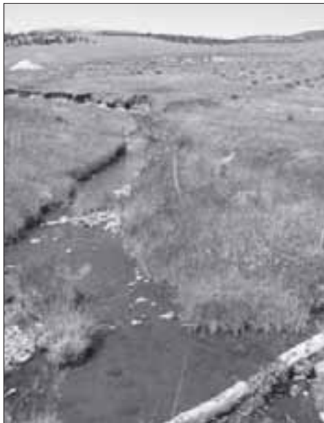
Upstream view of the Middle Reach of Comanche creek, October 2001.