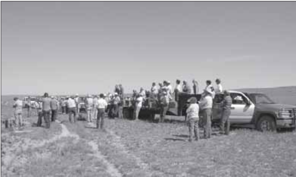
Participants of a landowner workshop near Ft. Morgan, Colorado on July 26, 2004.

dairy country of the Northeast, benefits from careful grazing by cattle, which keeps the meadows open and relatively free of encroachment by woody vegetation.