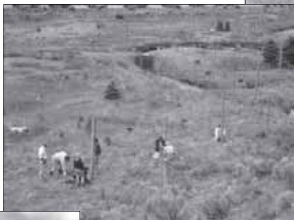
Middle & Bottom Left: Mini-elk exclosures installed by New Mexico Trout and Trout Unlimited during volunteer work weekends 2001-2004.