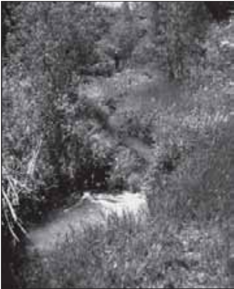
Date Creek After.

tion to its very core. Part of the core of the Leave It Alone assumption is the belief that, without humans the land would exist in a state of balance, of pristine health, of wilderness purity.