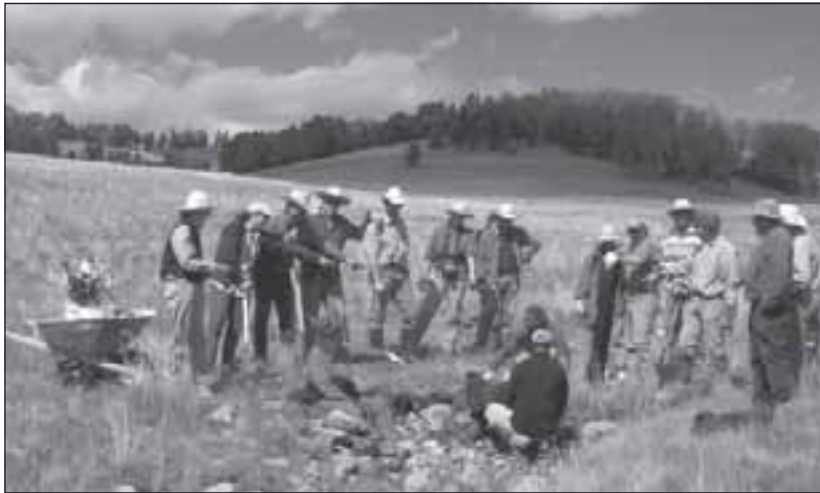
Quivira Coalition workshop participants, September 2003.