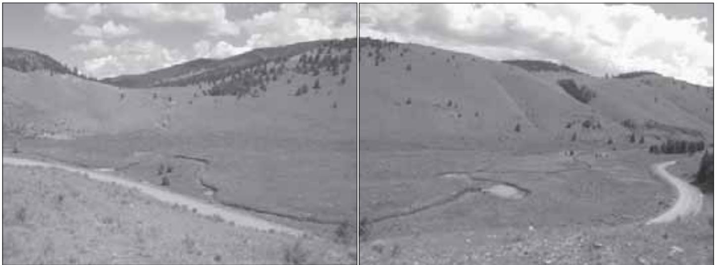
Panoramic view of Comanche creek looking north from Fernandez creek, October 2001.

The meeting of academics ended inconclusively and the question of quantifying the effects of collaboration on the "back forty," which was Aldo Leopold's metric for progress, has been on my mind ever since. I'll try to address it here by looking through the lens of a restoration project we've coordinated in a remote watershed in northern New Mexico.