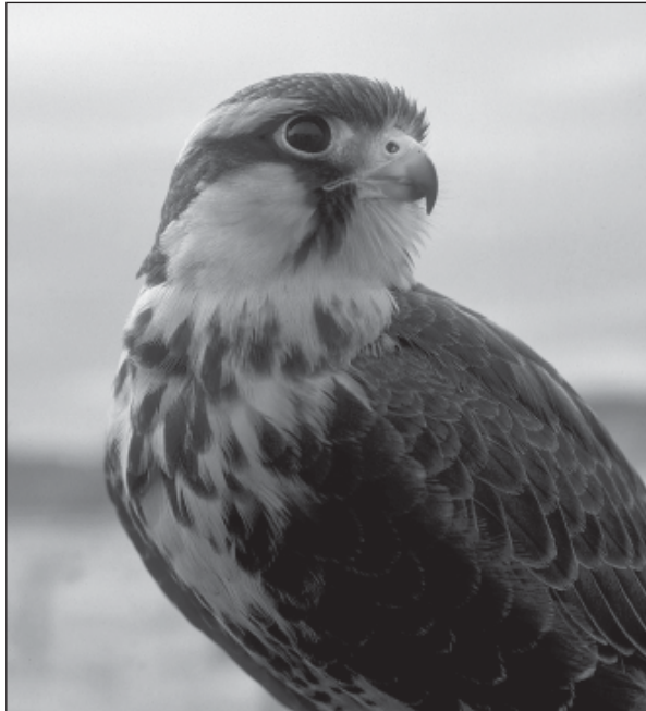
Northern Aplomado Falcon.