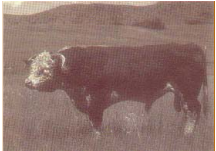
One of Victorio's prize-winning Hereford bulls grazing on the Buenos Aires, 1974. Note the absence of mesquites and the thick cover of grass, obtained by bulldozing and seeding.