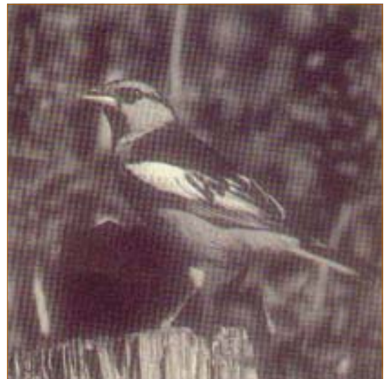
Bullock's Oriole.