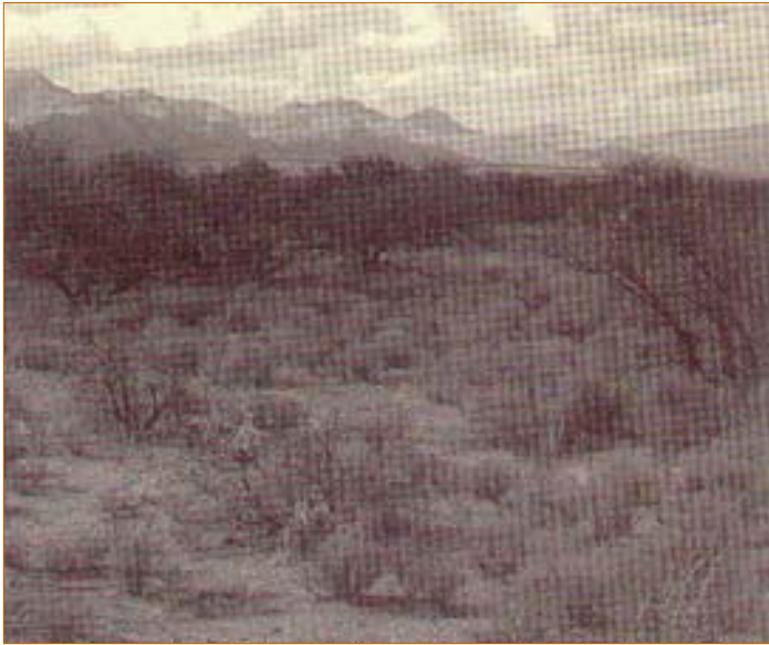
An area of the Buenos Aires that the Victorio Company did not revegetate. No cattle have grazed here in 16 years, yet the vegetation remains mesquite and shrub dominated.

There, perennial grasses constituted some eighty percent of vegetation cover; mesquite was only ten percent. (Old-timers report that ranchers actually brought mesquite pods from the Tucson area, in hopes of growing some shade for their cattle.) Stocking rates were considerably