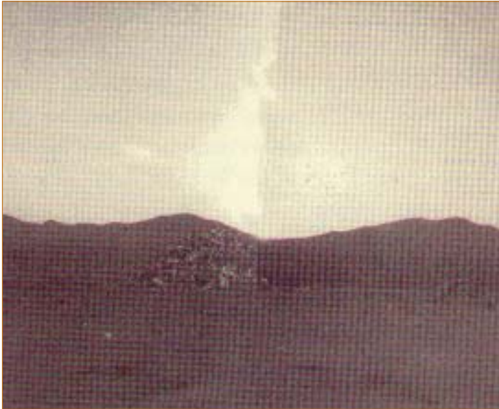
An area north of the Buenos Aires in 1903. The bones of dead cattle were gathered for use in making fertilizer.