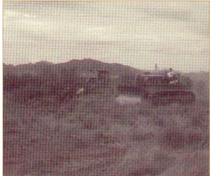
Bulldozing mesquite on the Buenos Aires, 1977.