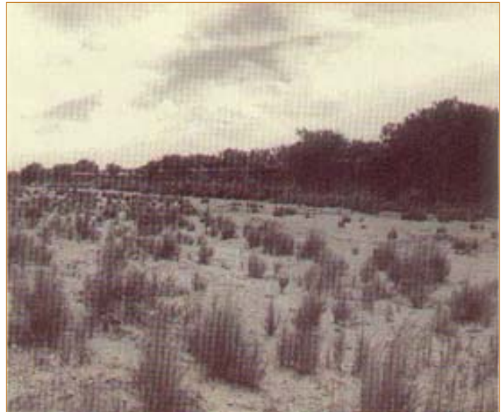
The Brawley Wash downstream of the Buenos Aires, 1998. Note the vegetation on the terrace, dominated by mesquite, and in the arroyo, dominated by shrubs.