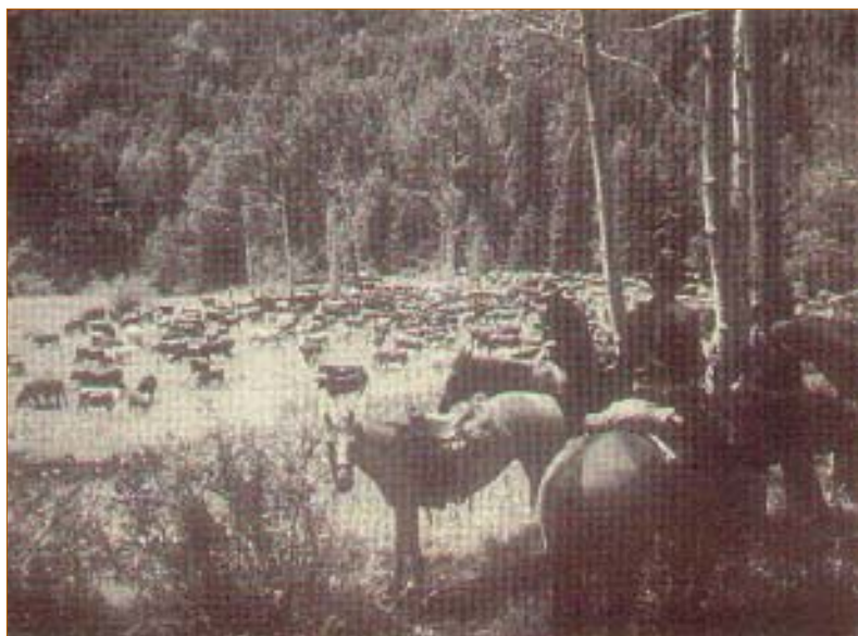
Cows being herded in the West Elks Wilderness Area.

fundamental philosophical question arises: Can land be “wild” if it is not healthy?