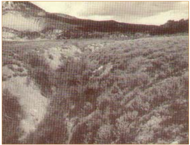
After: Upper Cottonwood, June 1998.