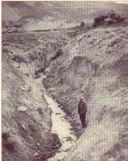
Before: Upper Cottonwood, May 1928, West Elks national forest land near Paonia, Colorado.

of this assessment, which the National Riparian Team calls Proper Functioning Condition (PFC), 4 is “to provide information on whether a riparian-wetland area is physically functioning in a manner which will allow the maintenance or recovery of desired values , e.g. fish habitat, neotropical birds, or forage, over time.” [Emphasis added.]