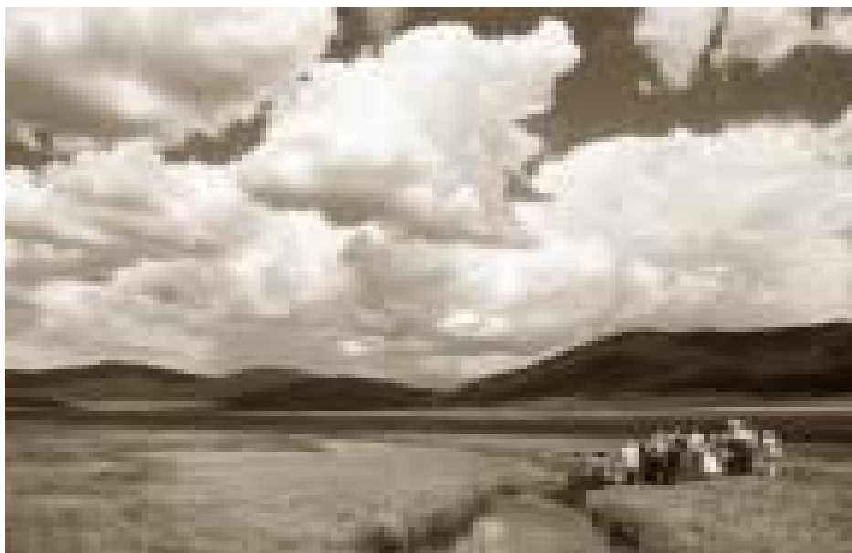
The Valles Caldera National Preserve.

I thought to myself, OK, they have it right, that is just where I need to be. So I followed the coyotes into the valley, until I came to what I hope will be the perfect location, representing just the right eco-variation in the landscape. This will be one of approximately 35 permanent rangeland monitoring sites across the Valles Caldera. As I finished confirming the soil type and mapping the site on my GPS unit, something made me look up—there I was sitting shoulder-deep in Arizona fescue, mountain muhly, and the yellowing, inscrutable sedges,