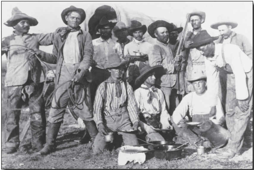
Diamond A Outfit cowboys from Cochise County, Arizona, 1880's.

The Western Range system also assigned carrying capacities—known as stocking rates, permitted numbers, or preferences—to each public land grazing allotment, figures that were destined to become the focus of conflicts between ranchers, agencies and environmentalists for decades to follow. In these and other ways, the Western Range set the terms for today's debates, not only on the landscape but also in law, science and the public mind.