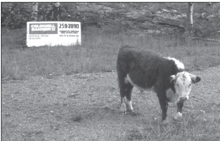
“The New West: cows versus condos?”

But this boom is apparently different. No longer is the region’s economic activity tied closely to natural resource extraction and agriculture, as in the past. Mining, farming, ranching and timber production are now rather modest parts of the West’s economy, and especially of its growth. Nowadays there is a more diversified economy featuring tourism, technology, industry and professional services. This boom will continue, because this booming West is new—the New West.