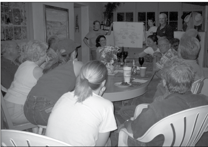
The "next generation" reporting on a new plan for the ranch during a family meeting.