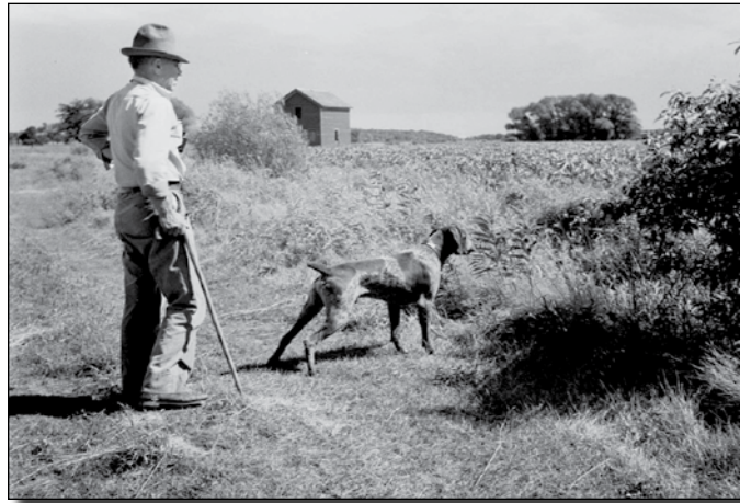
Aldo Leopold on farm, Lake Mills, Wisconsin.

Meanwhile, two generations of Americans have grown up with the conversion of open space to suburb as the standard trajectory of land-use change. Now, as the first rings of suburbs grow older and poorer, those who can't get no satisfaction in their current place move on to the gated communities and fortress homes of the exurban edge and beyond. 8 Urban flight and deindustrialization has hollowed out many