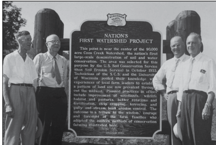
Historical marker at Coon Valley, Wisconsin with Hugh Hammond Bennett, first chief of the Soil Conservation Service (second from the left).

Conservationists in the 1930s experimented with a diverse array of arrangements that allowed individual landowners to coordinate their conservation