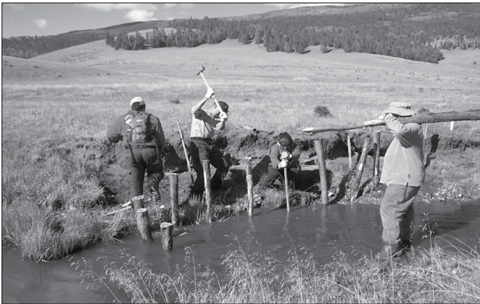
Santa Clara Fire Crew volunteers build erosion control structures to help protect an eroding bank and restore Rio Grande Cutthroat trout habitat along Comanche Creek in the Valle Vidal Unit of Carson National Forest, NM.

The meaning of working wilderness is two-fold. First, it