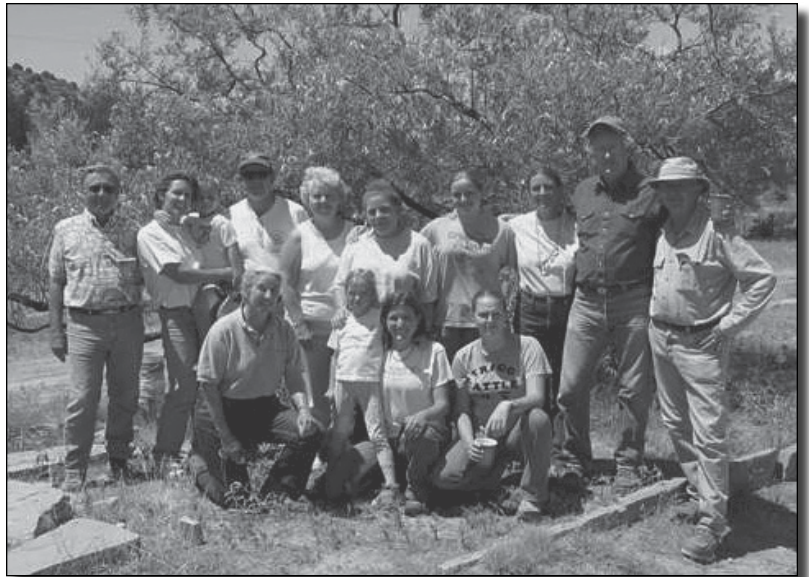
2003 Trigg Family photo.