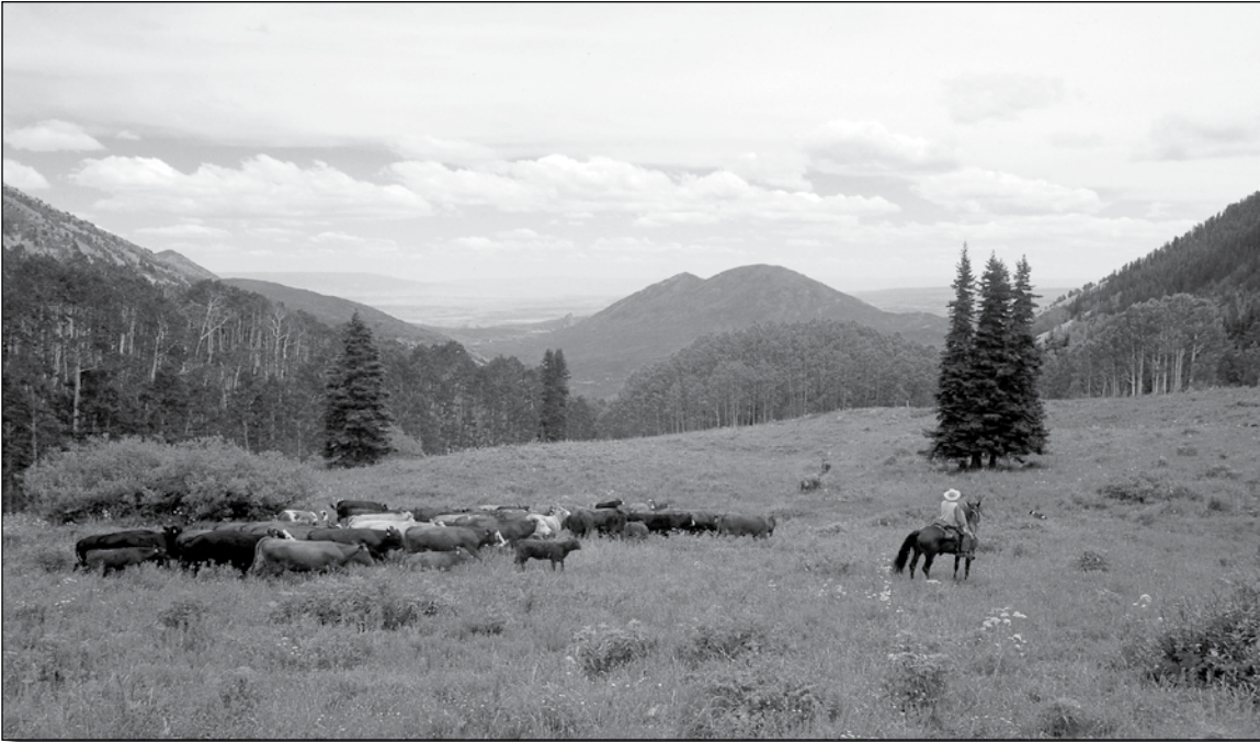
Herding in the West Elk Wilderness near Paonia, CO.

insists that human work can be compatible with functioning wildlands. This is contrary to conventional and legal definitions, which conceive of wilderness as a place where “man is a visitor who does not remain,” a landscape of recreation and contemplation rather than production and labor.