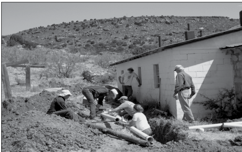
Family members installing a new septic system for the bunkhouse during the 2006 work week.